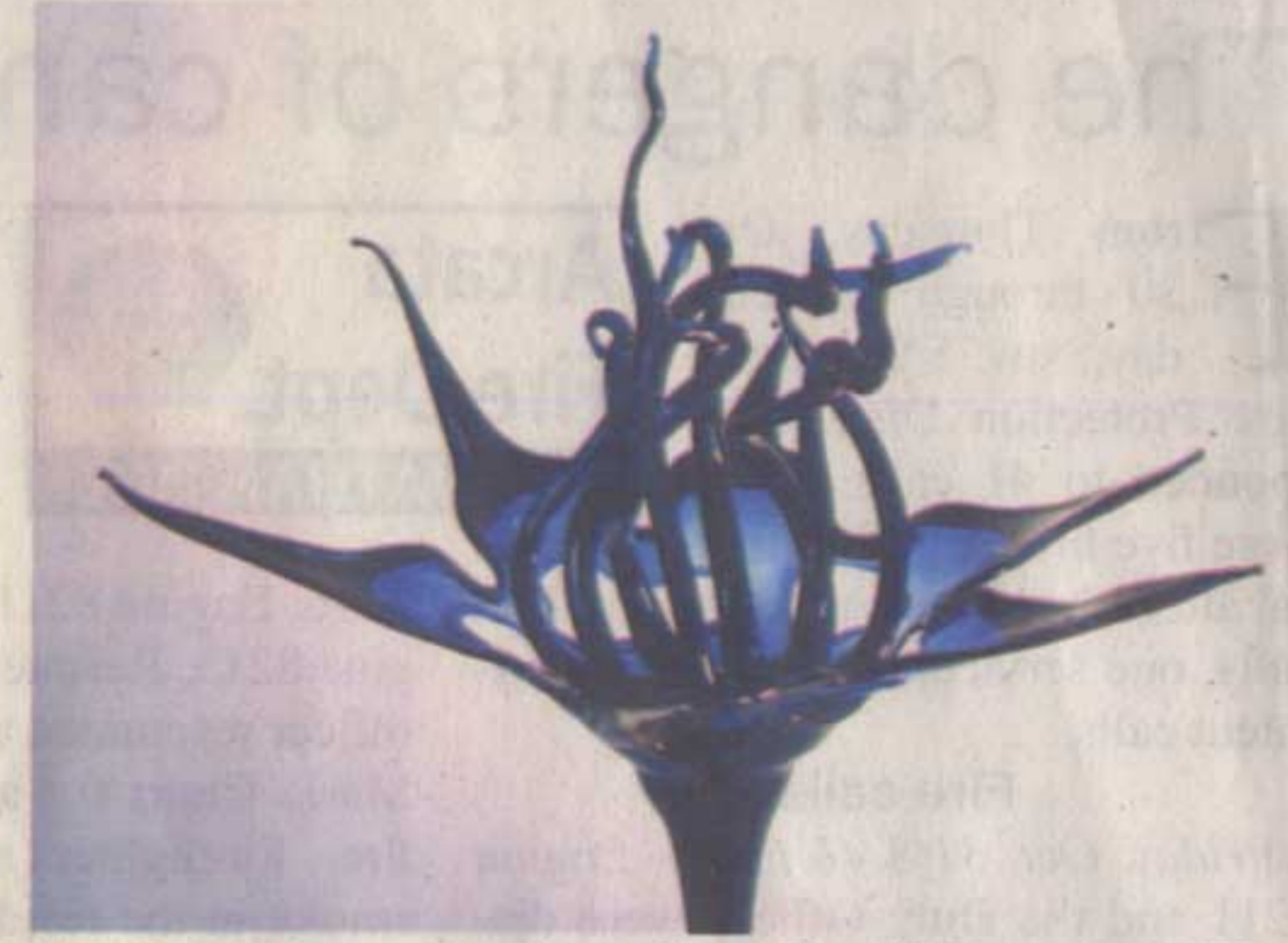
A detail image of a piece from the "Life on Io - Flora and Fauna from Far Out" series, borosilicate works by Blackstone Glass, showing at The Front Gallery & Gifts on Central Avenue.